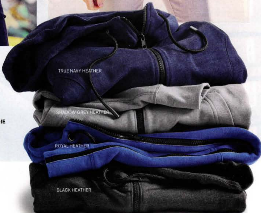
TRUE NAVY HEATHER

LNEA511 $46.90 • Thumbholes • Wide rib knit hem LADIES SIZES: XS-4XL